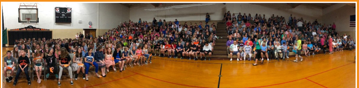
Students in all grades received their academic awards.