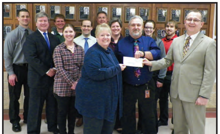
Homestead Savings Bank Presenting Their Donation to the MADD Committee